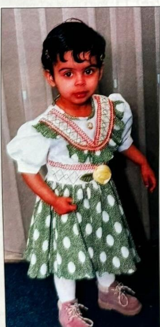
Seventeen per cent of Rochdale schoolchildren are bilingual.

services offering input to this community enable us to build up a database of information, including details of linguistic profiles and religious affiliation.