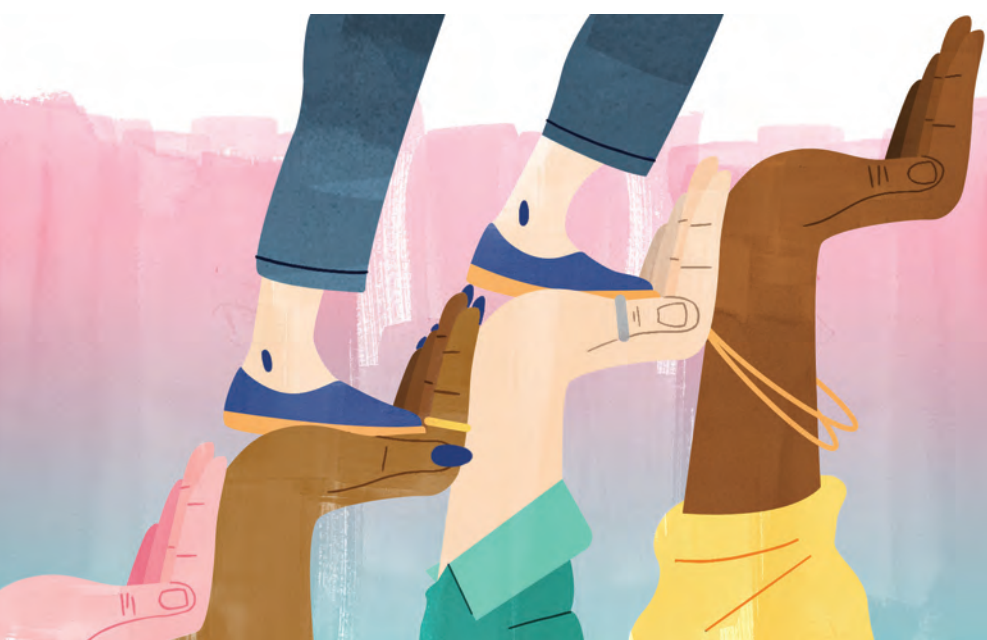
ILLUSTRATION: JAMIE WIGNALL